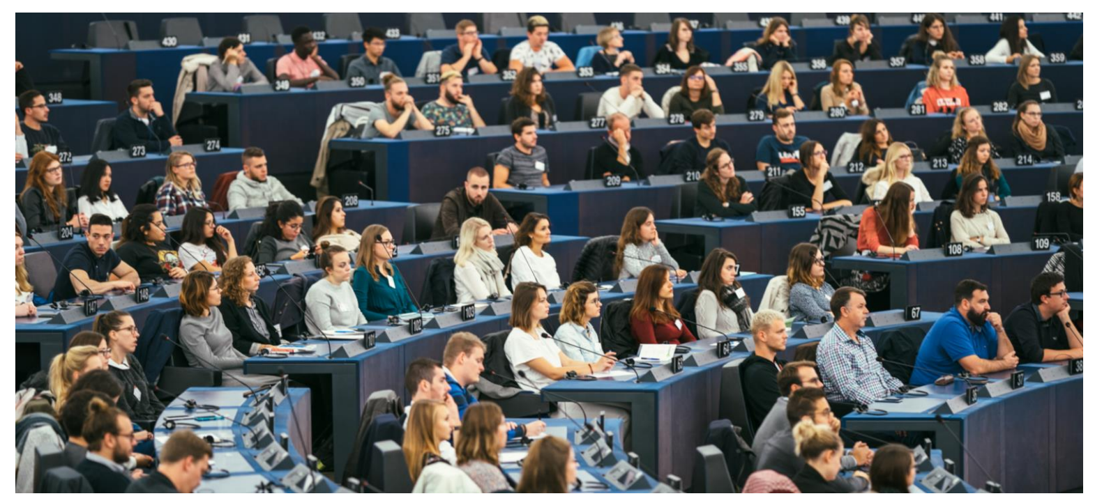
Thematic conference on the digital single market held in 2018 at the European Parliament

Given its European roots and geographic location—in the capital of Europe, it is only natural that EM Strasbourg offer its students unique courses and experiences with intercultural and European flair: more than 110 European partner universities; French-, English-, and German program tracks; dual degrees; specific courses; visits; conferences, etc.